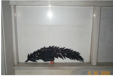
Thurston's Crypt Stone Green Lawn Abbey

the seekers of magic, spirits and mysticism this century do not seem to congregate in as respectful a manner as when Sir Arthur Conan Doyle was on the lecture circuit 100 years ago. The Abbey is in a sad state of disrepair. Although closed to the public, break-ins are frequent and vandals have desecrated many of the crypts. Stained glass windows have been broken and bricked up. Statues that once adorned the tombs have been mostly destroyed. Suffering from years of vandalism and financial distress, the Abbey may be facing the wrecking ball causing Thurston's remains to be relocated to unknown grounds.