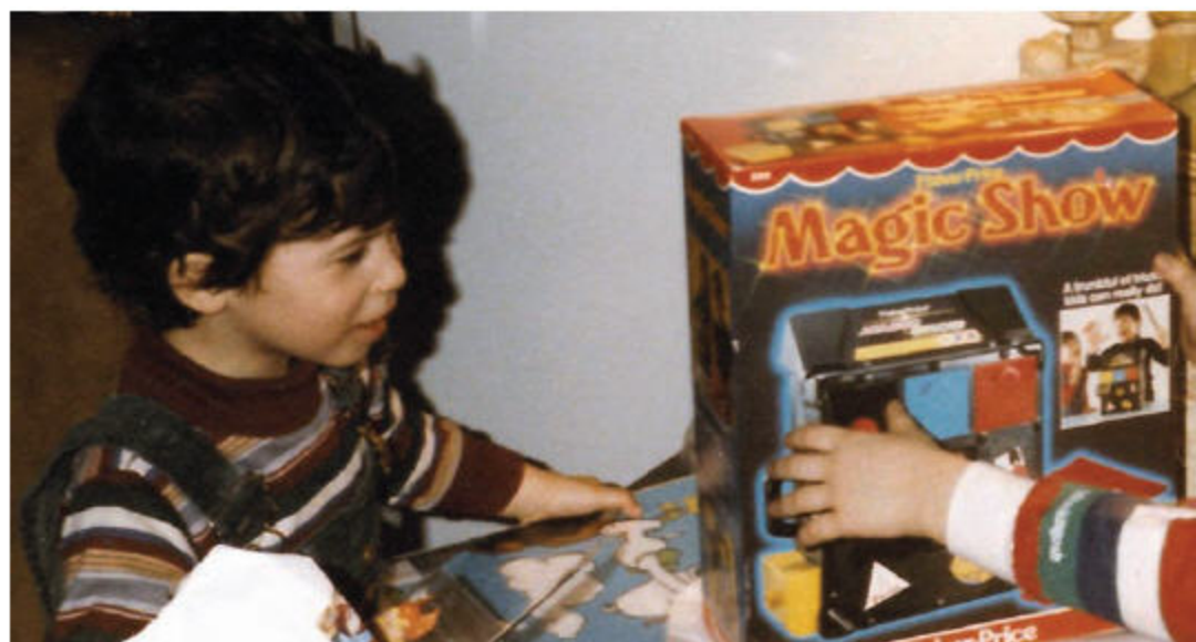
Rory was first mesmerized by magic when he first saw a Fisher-Price magic set, at the age of three.

A large Wrigley's Pepsin Gum box measuring 18" x 5" x 3" that was produced out of a top hat during a Howard Thurston performance while promoting the product;