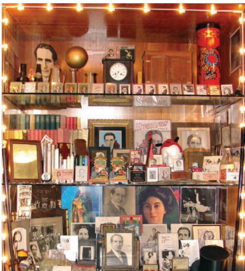
One of the display cases of Thurston memorabilia in the Rory Feldman Collection.

Public Business Library's Power Up! Business Plan Competition. New developments occur on a nearly daily basis, and he is currently scouting out a location for the museum. He has established a board of directors, of which I am proud to be a member. Among the current goals of the board of the directors are decisions on the location of the museum and an official announcement of what the museum will offer to the public and the world of magic.