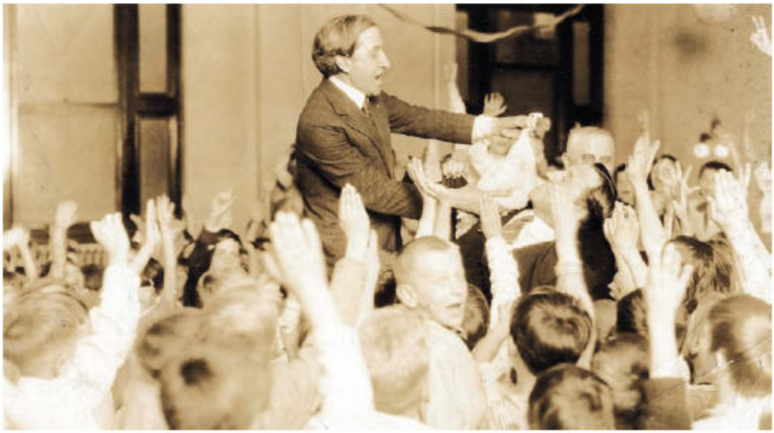
Thurston loved children and performed for many charitable causes.

exhibit featuring props that Harry Houdini used in his famous escape performances.