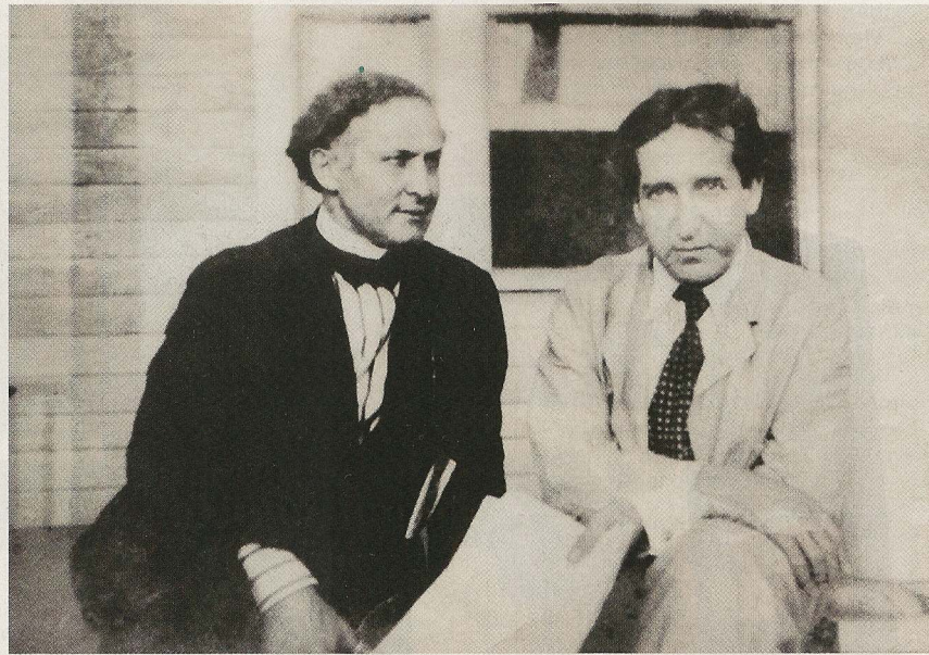
Houdini (left, with Thurston) wasn't actually a very good magician.